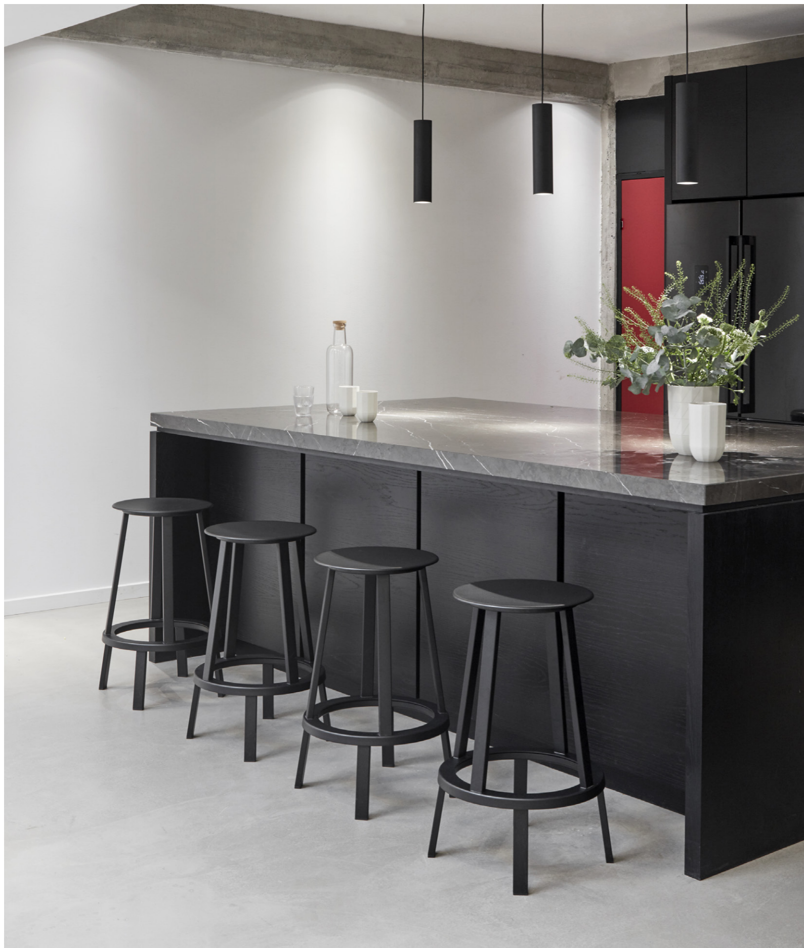
Revolver Bar Stool | Black powder coated steel