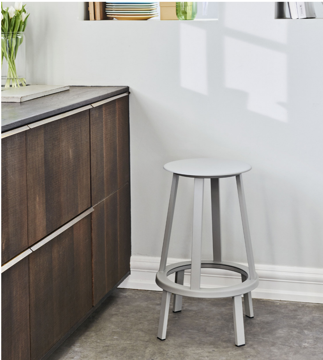
Revolver Bar Stool | Sky grey powder coated steel