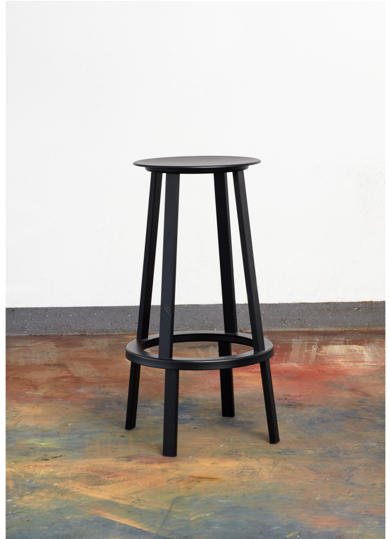
Revolver Bar Stool | Black powder coated steel