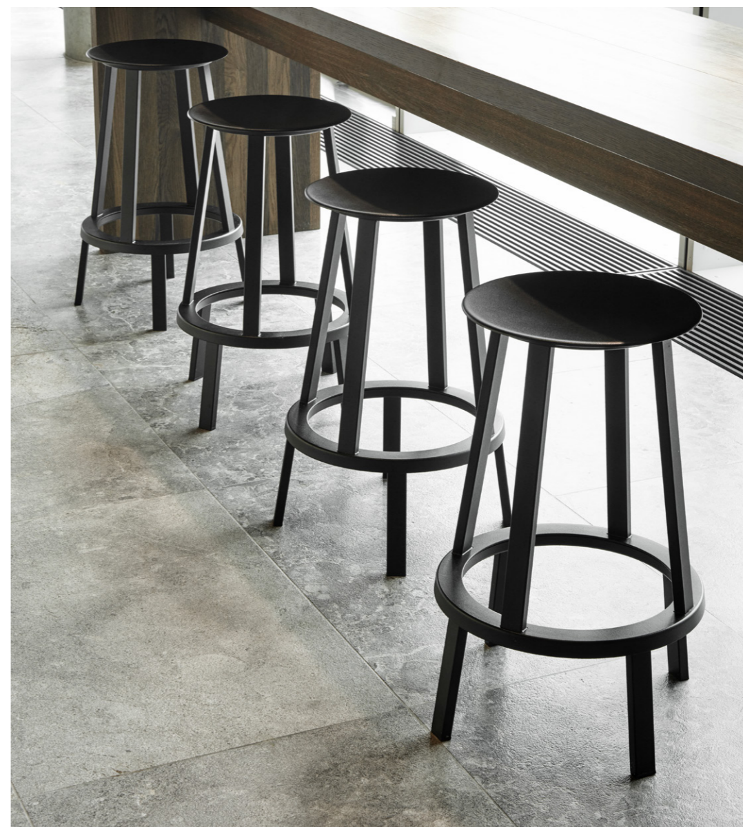
Revolver Bar Stool | Black powder coated steel