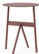
Stock Table H: 46 x D: 37,5 x Ø37 cm