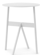
Stock Table H: 46 x D: 37,5 x Ø37 cm