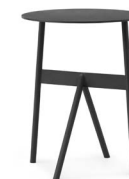
Stock Table H: 46 x D: 37,5 x Ø37 cm