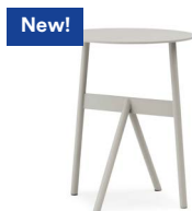
Stock Table H: 46 x D: 37,5 x Ø37 cm