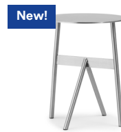
Stock Table H: 46 x D: 37,5 x Ø37 cm