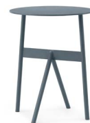
Stock Table H: 46 x D: 37,5 x Ø37 cm