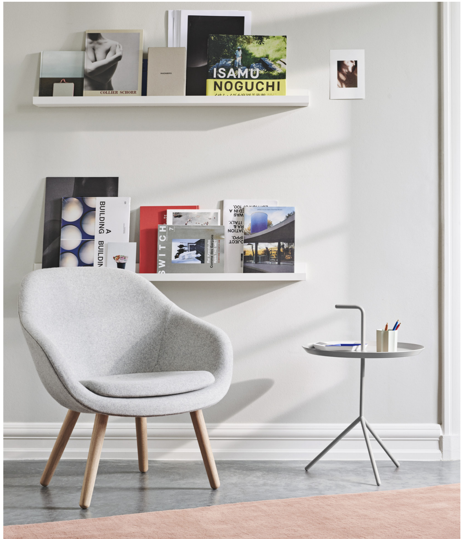
DLM | Grey