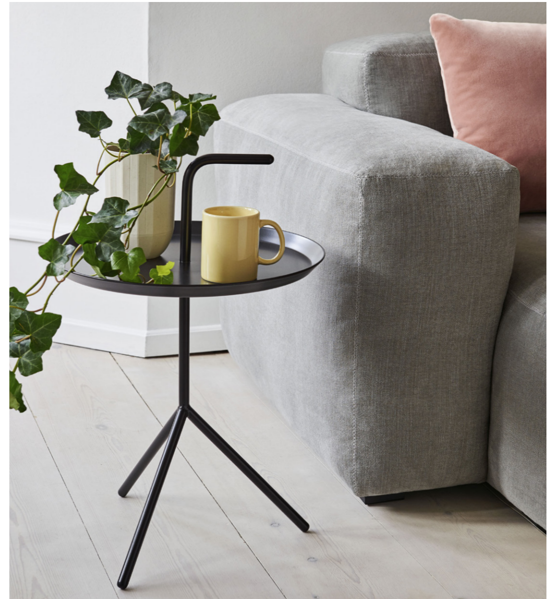
DLM | Black