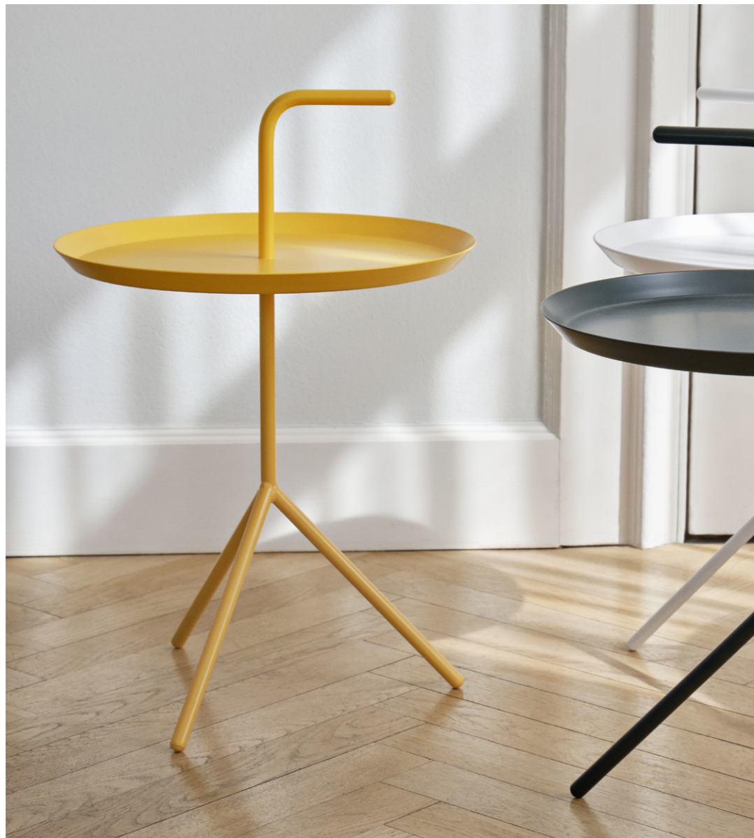
DLM | Sun yellow