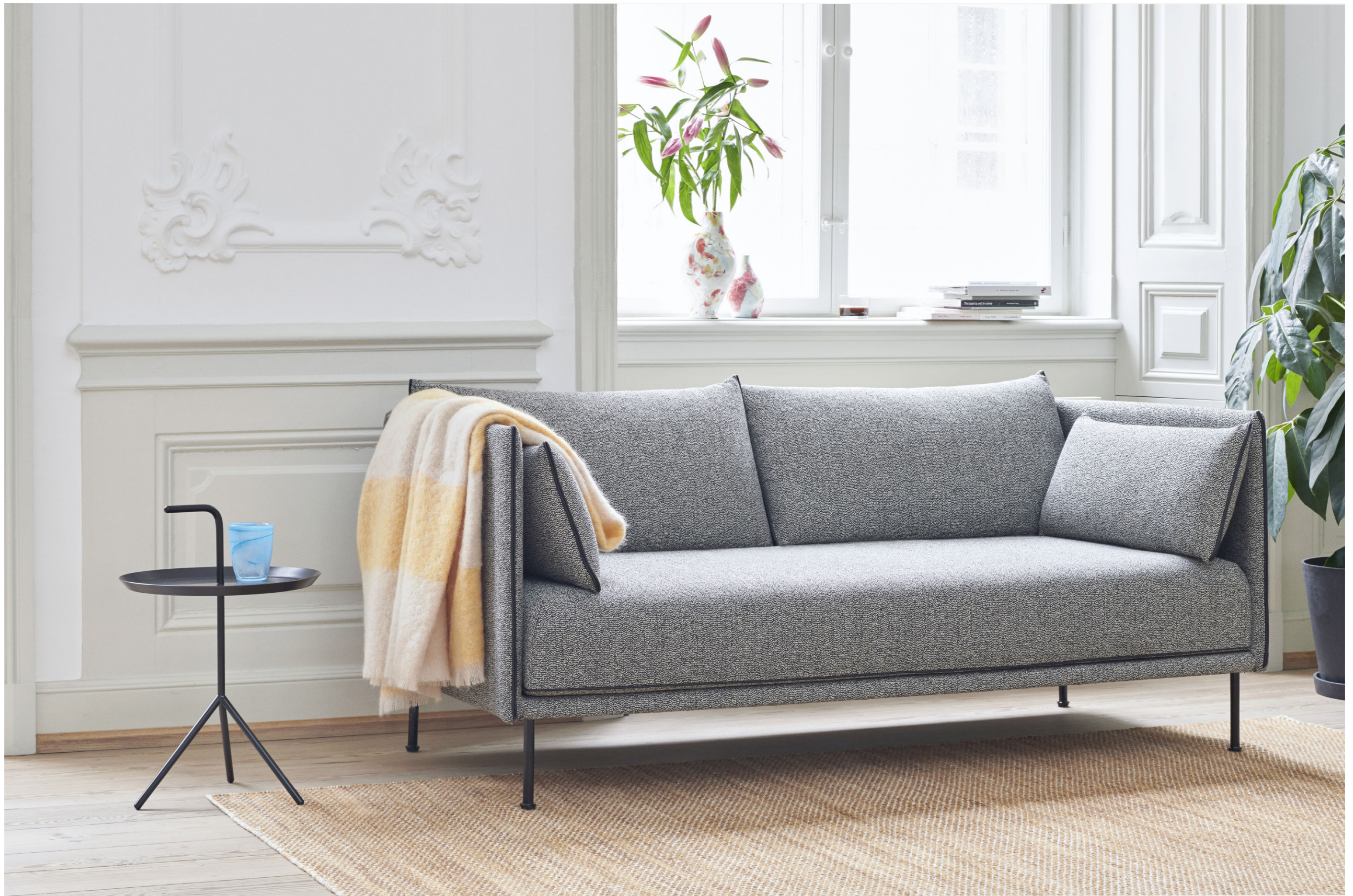
DLM | Black