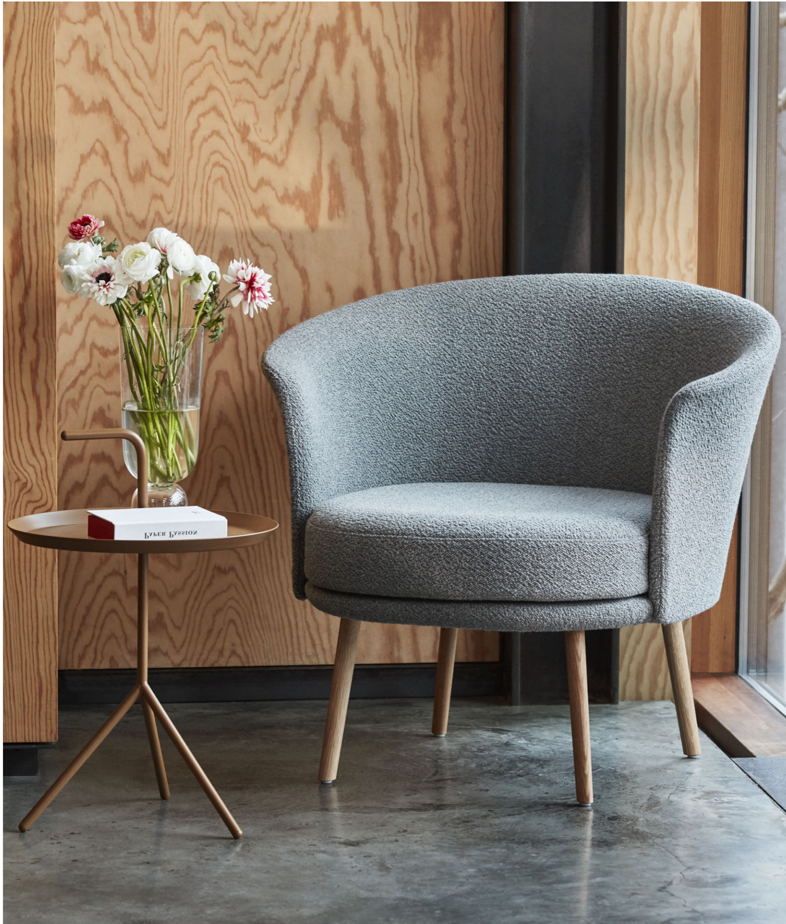
DLM | Toffee