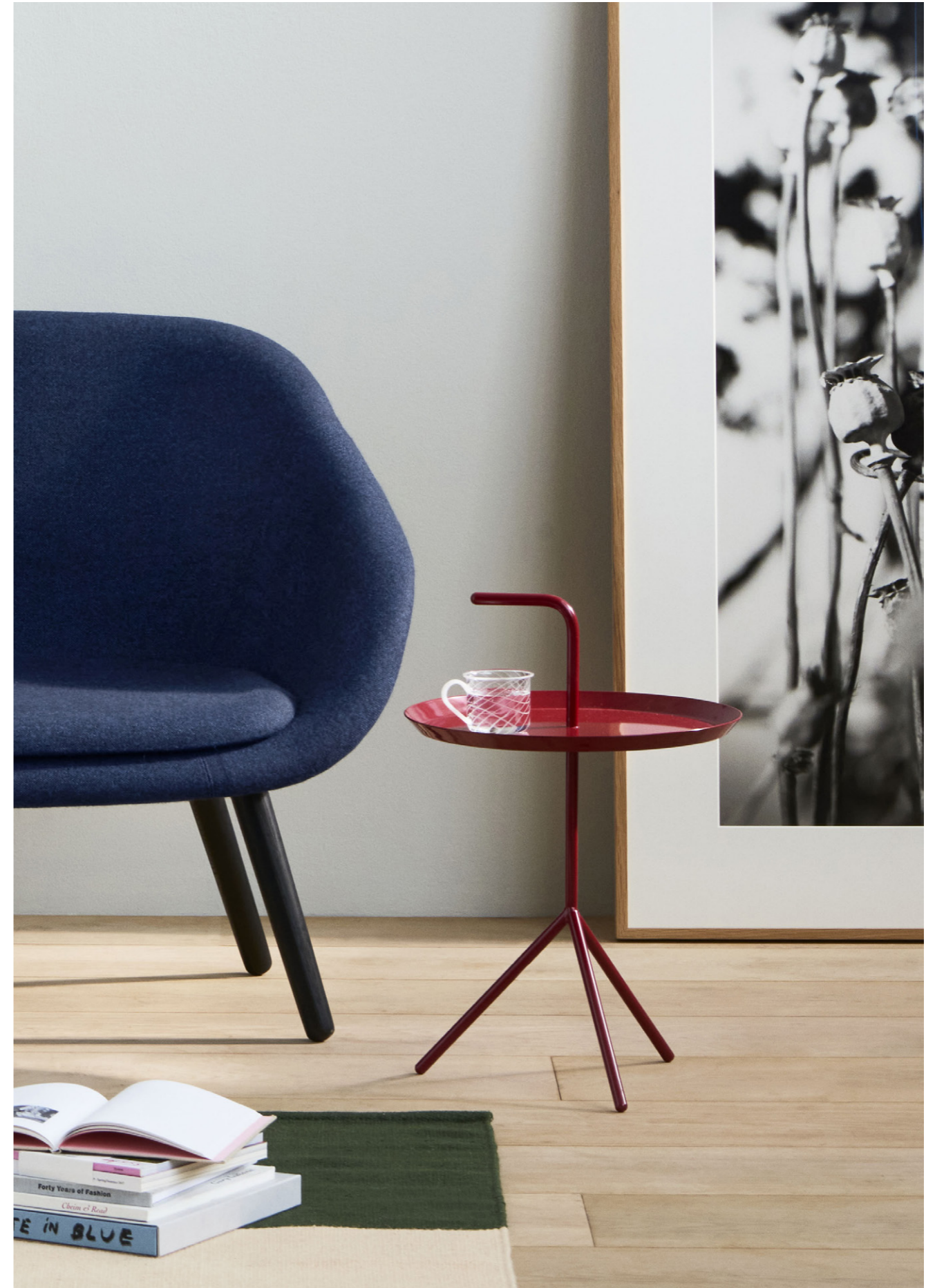
DLM | Cherry red high gloss