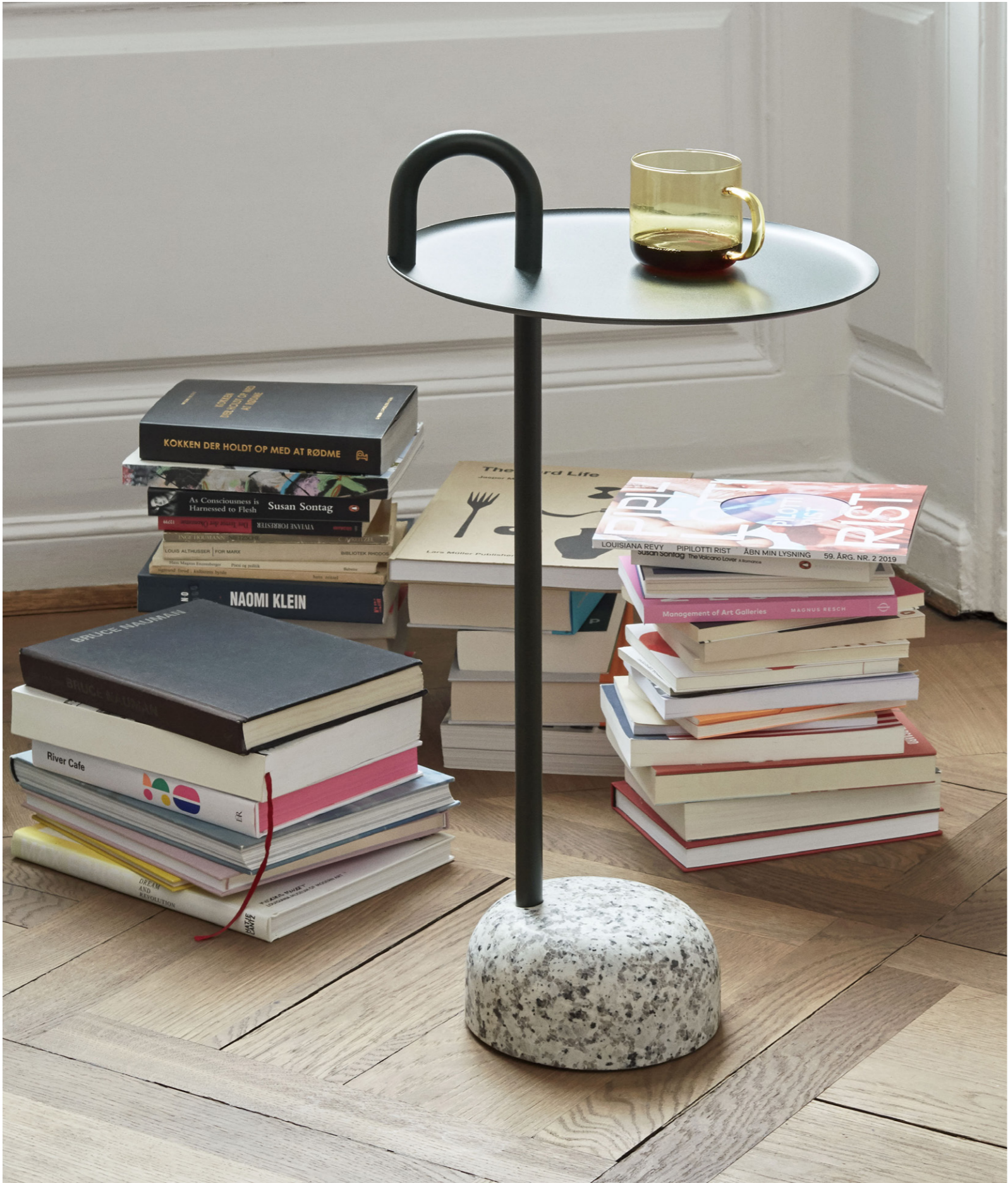
Bowler | Fir green