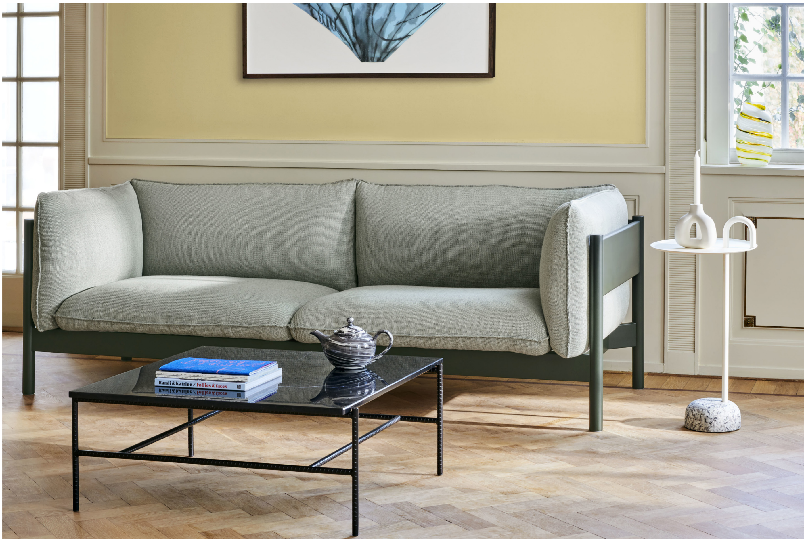
Bowler | White