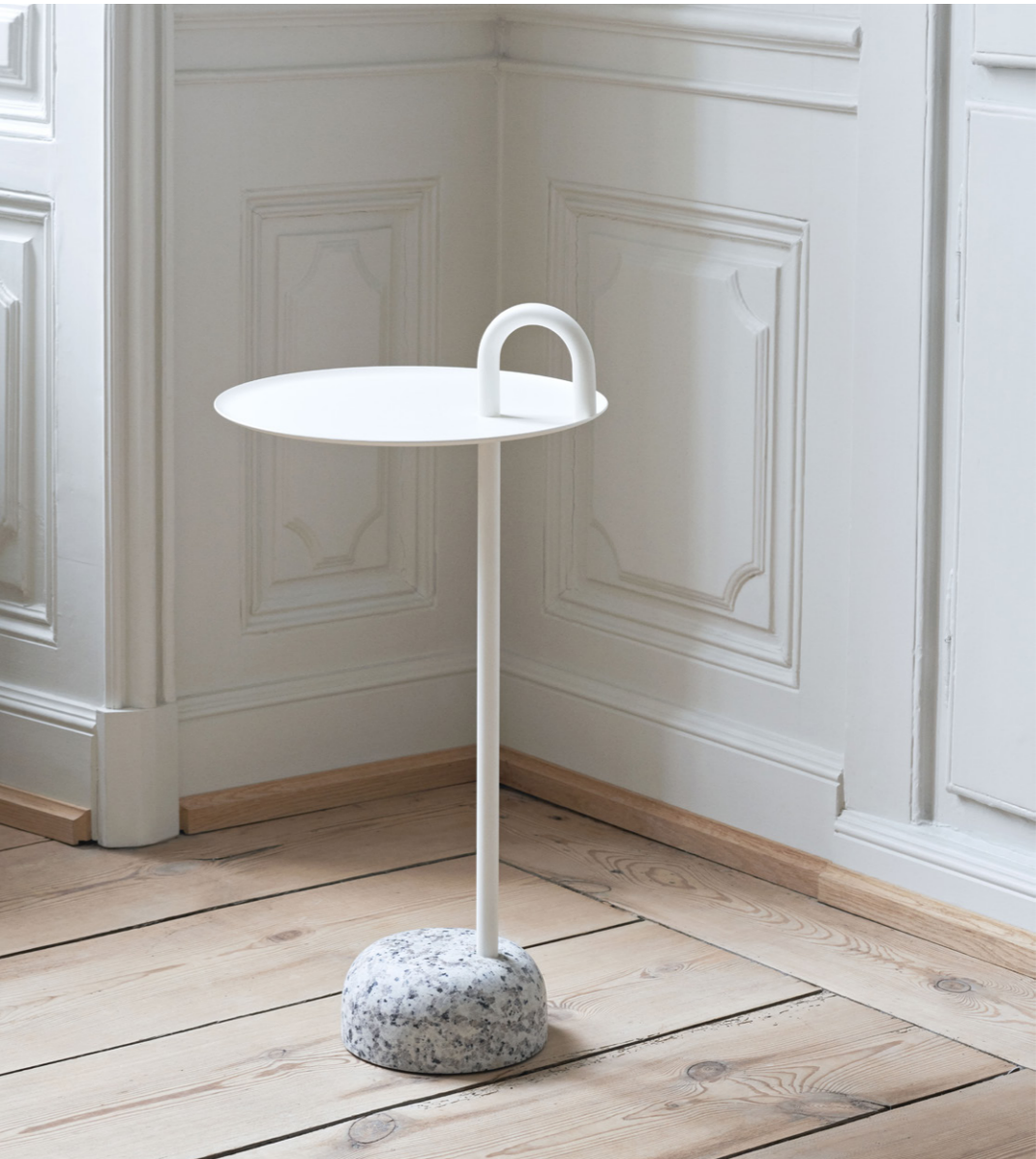
Bowler | Cream white