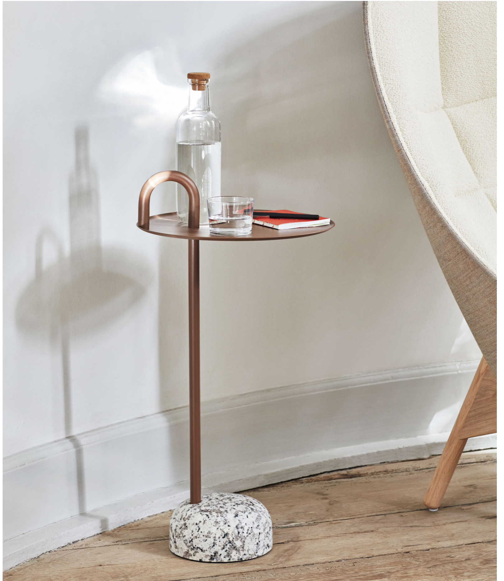
Bowler | Pale brown