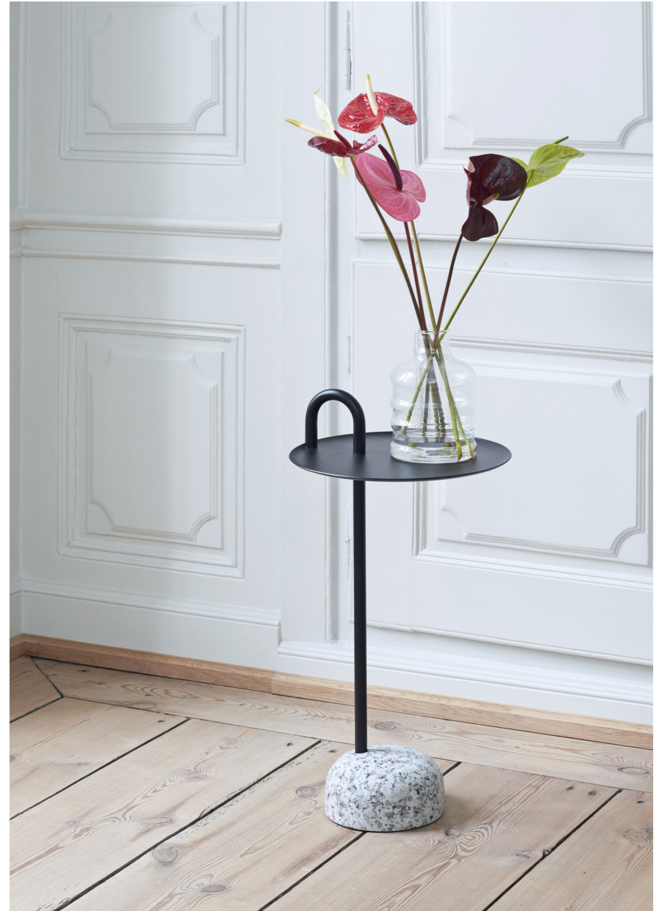
Bowler | Black