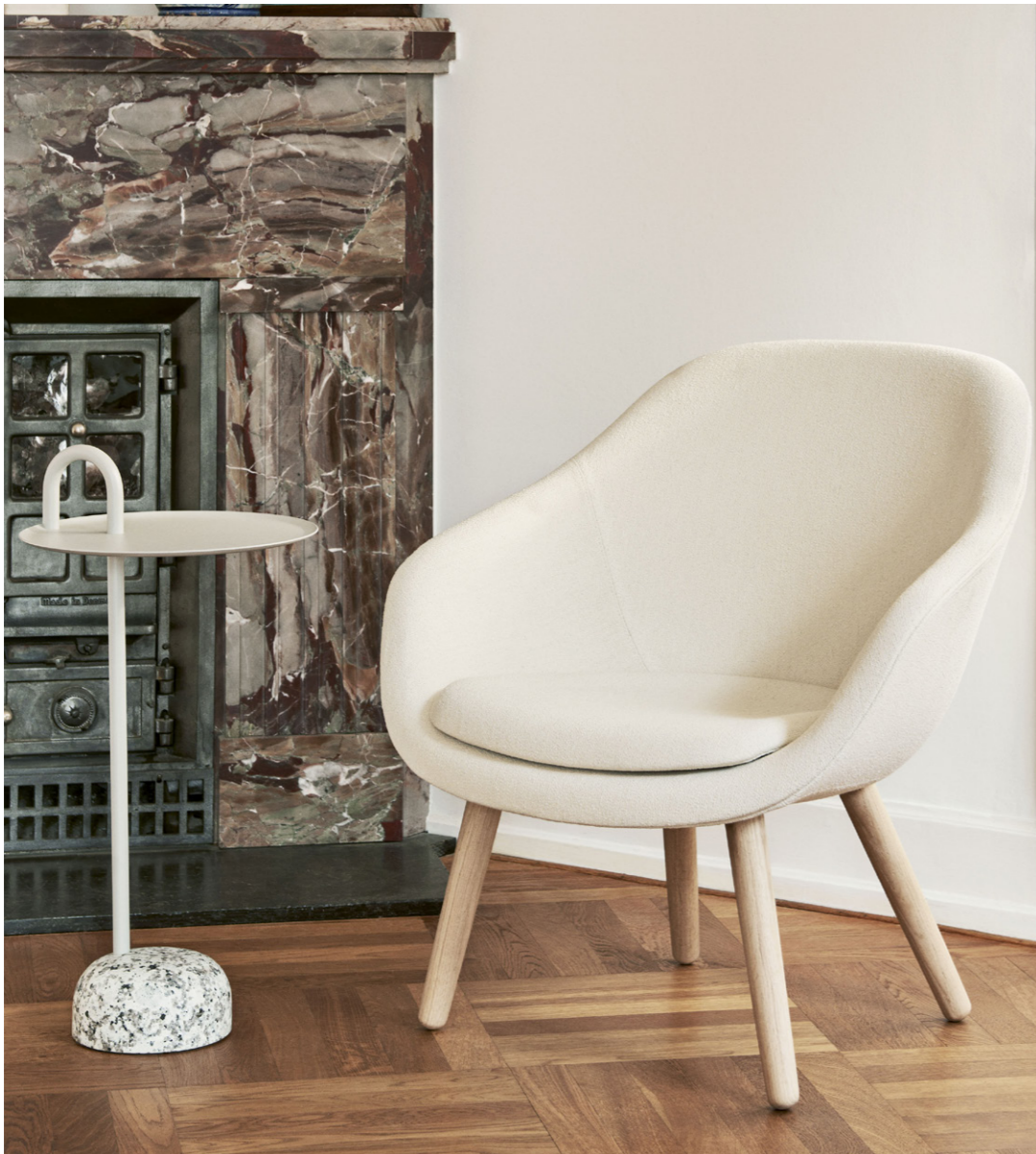
Bowler | Cream white